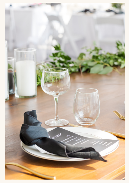
"They say when you meet the love of your life, time stops, and thats true."